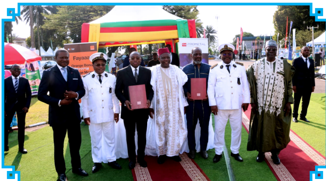
Partnership agreement endorsed by government officials

CNSC lends support to actors of the banana-plantain sector.