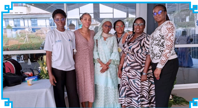
Delegation of CNSC Ladies

Conference for female professionals of the maritime and port sectors.