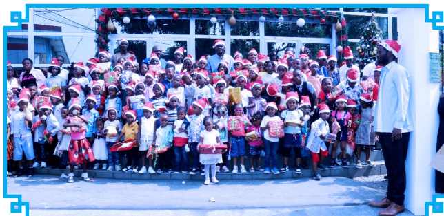
Kids pose with their Christmas gifts

Some 150 kids came out to enjoy the festive season.