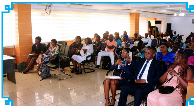
Participants at the training workshop

Banking institutions invited to enlighten trade professionals.