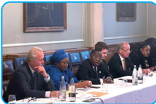
CNSC GM at CWEIC Advisory Council Meeting