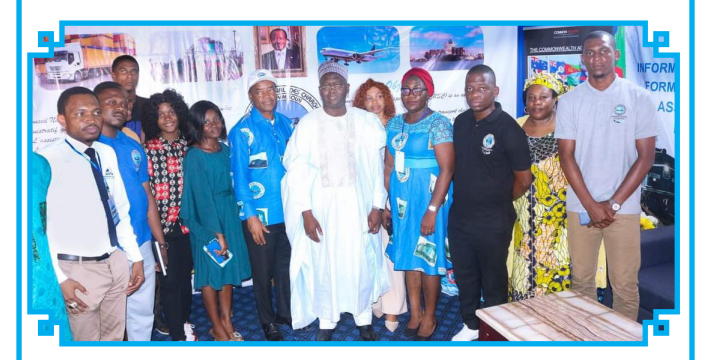
GM SIC visiting CNSC's stand

Missions, achievements and projects showcased at the trade fair.