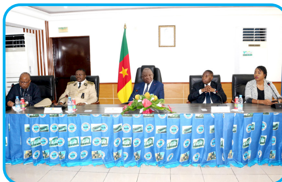
Panel of the working session