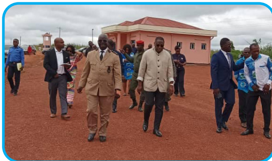
On-site visit of the facility

The CNSC Ngoulentang Trucker Accommodation Centre is a logistics base for actors of cross-border trade carrying goods from or bound for landlocked countries like Chad and the Central African Republic. Constructed on an area measuring 5 hectares, the trucker accommodation centre offers modern facilities with comfortable living and working conditions, thereby guaranteeing the safety of users and their goods. It includes a parking lot for 500 trucks, lodging facilities, an eatery, a shopping area, a mosque, a borehole, a power generator, an administrative block and watchtowers. The facility has been operational since 14 October 2022.