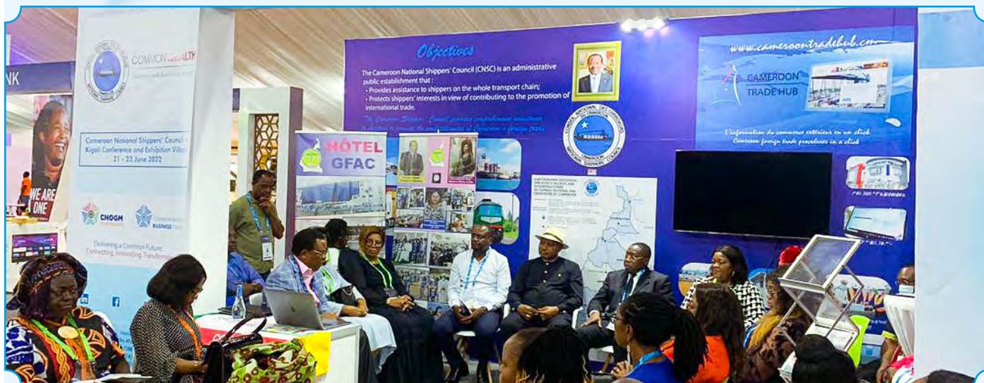
CNSC's stand at the CBF