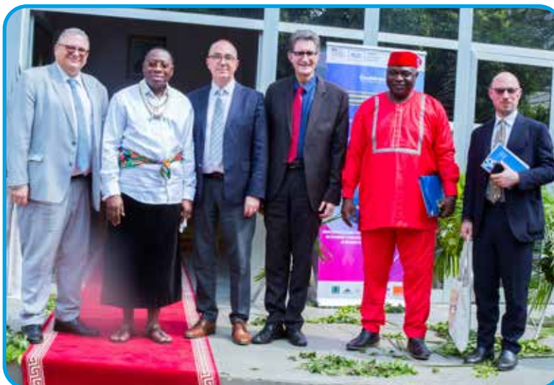
Group picture at the DMM

recalled that in accordance with the promise made by the French President, H.E. Emmanuel Macron , in his 2018 speech in Ouagadougou, the restitution of Africa's heritage has already begun thanks to the law of 24 December 2020 authorising the return of some