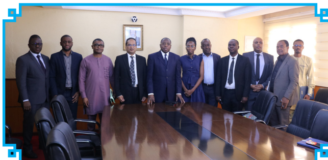
Working session with Bangladeshi High Commissioner

The working visit ended with a tour of the CWEIC Hub for Cameroon, Gabon and Togo.