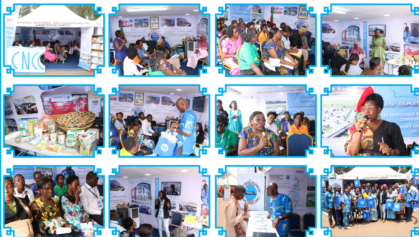
Photo-reportage on Promote 2024