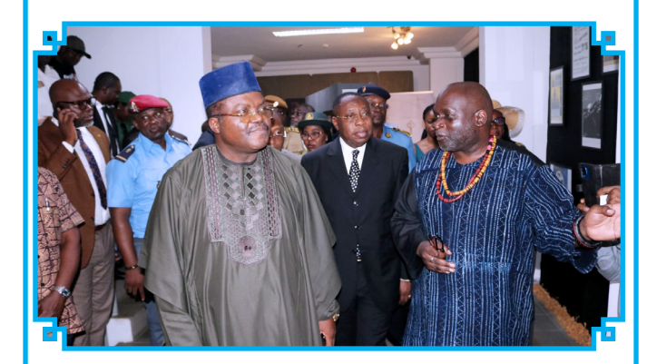
TLittoral Governor and retinue visiting the exhibition

Douala Maritime Museum exhibits on the artist's career.