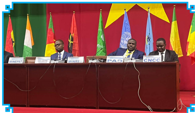
Panel at the conference

CNSC delivers a presentation to edify shippers.