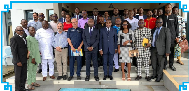
Participants at the meeting