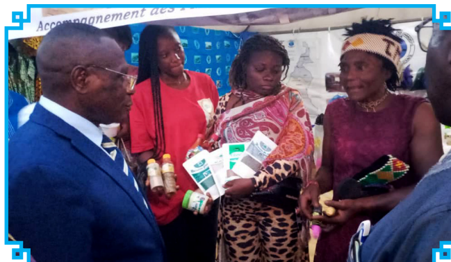
Governor visits CNSC's stand

CNSC offers stands for the exhibition of Made in Cameroon products.