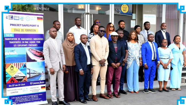
Participants at the training

CNSC participates in the SAFE Port 2 project in Cotonou.