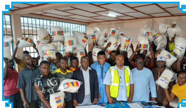
Recipients of mosquito nets

Transporters at the Dibamba Trucker Accommodation Centre receive mosquito nets.