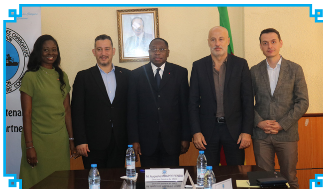
CNSC's General Manager poses with Turkish delegation

The Turkish delegation solicits CNSC's support for their upcoming trade mission.