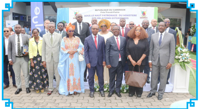
Participants at this first edition

On Tuesday the 21 April 2026, the first session of the Economic Francophonie, co-organised by the Ministry of External Relations, is holding under the theme: “Leveraging the AfCFTA to integrate SMEs into Regional Value Chains” . The session lasted two days and brought together administrative bodies and enterprises for discussions on issues affecting the activities of SMEs.