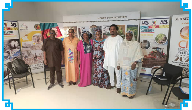
Experts invited by Women Up Africa