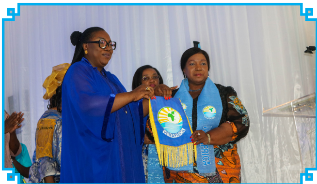
Transfer of power

Discussions at the association's General Assembly touched on several themes