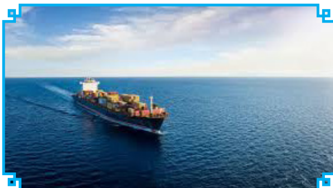
A vessel on the Red Sea

Several pirate activities in the Red Sea disrupt transi.