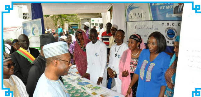
Minister in charge of SMEs visiting CNSC stand

CNSC used this event to raise awareness about its missions.