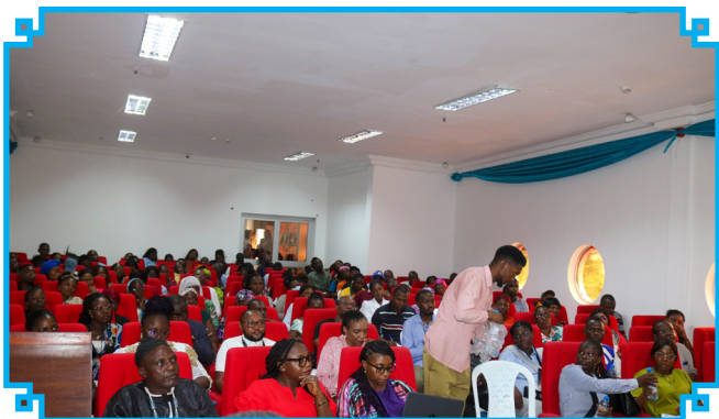
Participants at the session

Shippers attend training seminar organised by the CNSC.