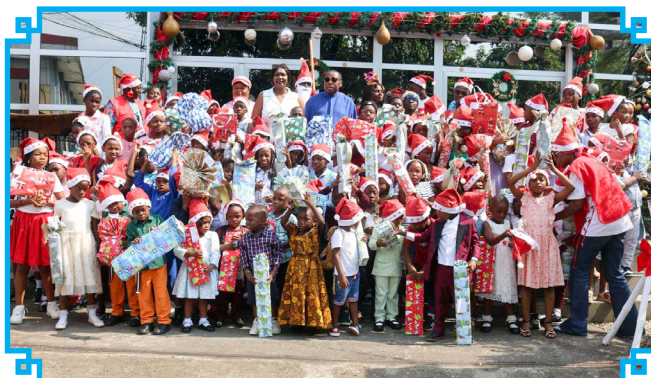
Happy children pose with their gifts

As has been the case each end of year, the Cameroon National Shippers' Council (CNSC) organised its flagship event dedicated to children, named: "Christmas at the Douala Maritime Museum" . From 20 to 24 December 2025, more than three hundred children aged between 3 to 15 took part in festive and educative activities organised at the museum. The children visited the museum's attractions, discovered the Storm Room, and had a feel of the marine world through interactive and exciting displays.